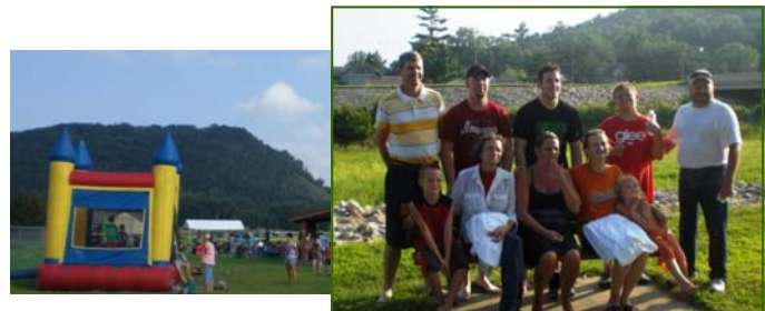
Among those baptized were 3 from one family from 3 generations!